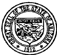
Jane Dee Hull Governor