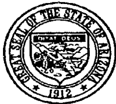
Jane Dee Hull Governor