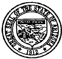
Jane Dee Hull Governor

State of Arizona Arizona Geological Survey 416 W. Congress, Suite 100 Tucson, Arizona 85701 (520) 770-3500