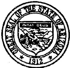
Jane Dee Hull Governor