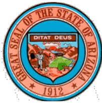
Douglas A. Ducey Governor