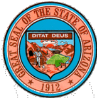
Douglas A. Ducey Governor