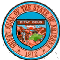
Douglas A. Ducey Governor