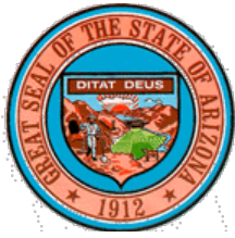
Douglas A. Ducey Governor