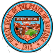
Douglas A. Ducey Governor